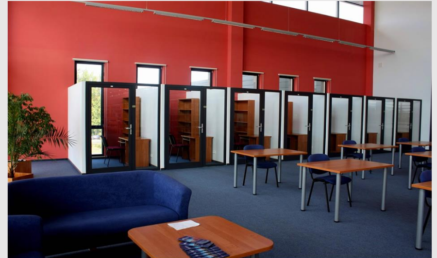
Individual study room