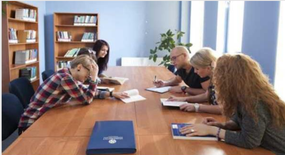
Group study room